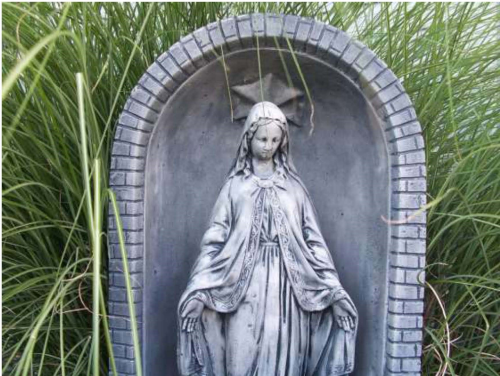
Our Lady Star of the Sea